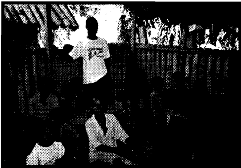
Kindergarten class and teacher inside the sparse class room.

The tour took all of 5 minutes. The kitchen is about 15 x 15. A bamboo roof with mud walls. I asked Richard where the money