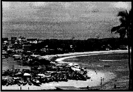
The orphanage is located 10 miles from the Coastal village of Elmina.

phans and let God lead you concerning how to respond.